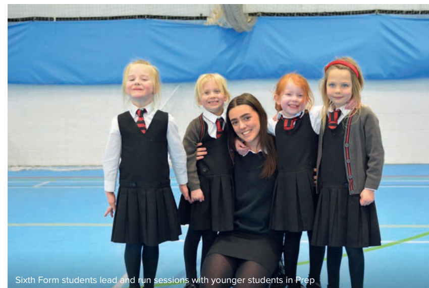
Sixth Form students lead and run sessions with younger students in Prep

The weekly Beyond the Curriculum session offers Sixth Form students the opportunity to take on further leadership roles within the School with recent examples including sports coaching younger pupils in Little School or supporting Prep teachers.