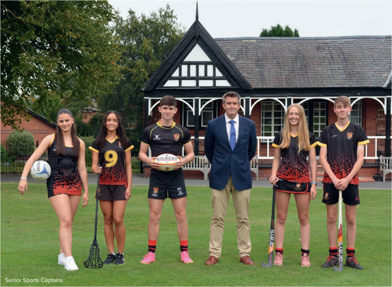
Senior Sports Captains

As students move up the School and play for the Senior teams, captains and vice captains may be asked their opinions on selection, playing style and will often be found running drills with parts of the squad as part of training, or even going down and working with younger teams.